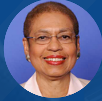
Eleanor Holmes Norton Candidate - Delegate to US House