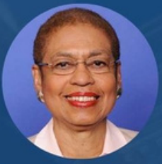
Eleanor Holmes Norton Candidate - Delegate to US House